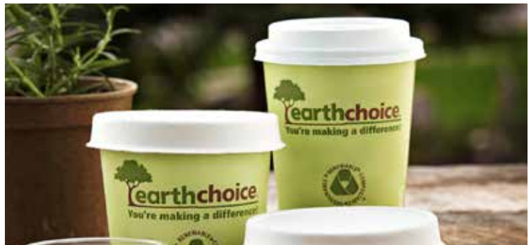
Hot Cups & Soup Cups